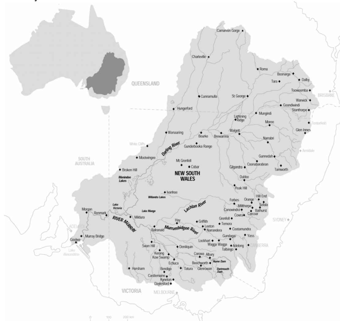
Figure 1. The Murray-Darling Basin

The Murray-Darling Basin has an area of 1,060,000 km 2 and extends into Queensland, New South Wales, Victoria, South Australia and the Australian Capital Territory.